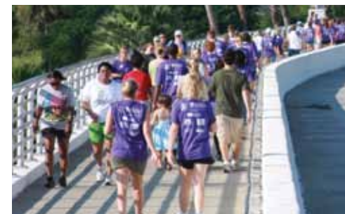
At left: Hundreds of walkers cover the Ringling Bridge at the annual Stepping Out Against Domestic Violence Event to raise awareness during Domestic Violence Awareness Month.