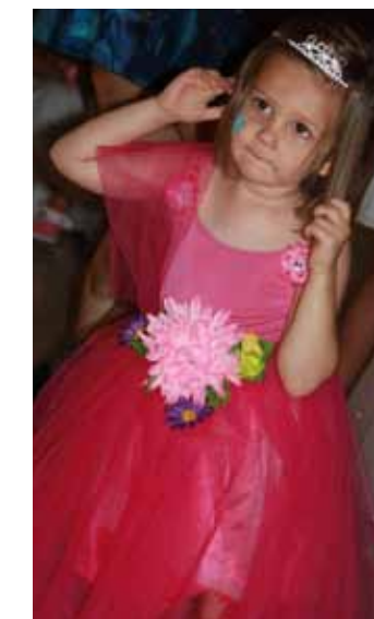
Right: Princess Eliza shows off on the dance floor at the Prince & Princess Ball