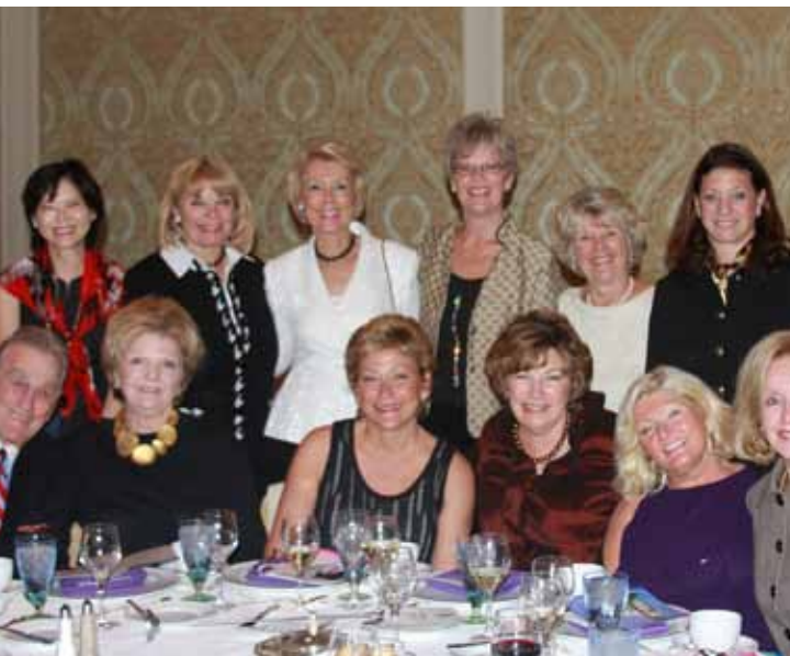
Below: Ladies from the local "Tea to Tequila" group at the 2010 Fashion Show at the Ritz-Carlton Sarasota.