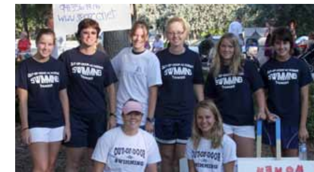
Above: The Out of Door Academy's Swimming Team as the "Most Spirited" team of walkers at last Fall's Stepping Out Against Domestic Violence Walk.